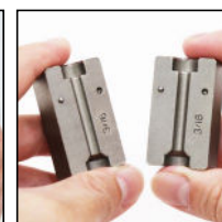
Dimples on dies ensure alignment