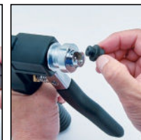
Detent ball provides quick punch change