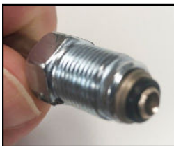
Power Steering Rack Flare Made with PFT700