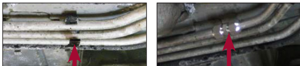
RUSTED A/C LINE

Rear A/C Line Repair: A/C lines leak due to rust and corrosion. In this circumstance, a line holder has rubbed against the line and a leak hole has developed. Customer wants it repaired effectively and economically.