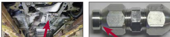
REAR A/C LINE

Rear A/C Line Block Off Repair: A failed rear A/C component can cause system-wide failure. Customer wants to have the front A/C system work and block off rear part of system.