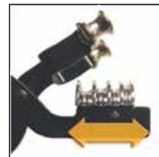
SLIDE-TO-SIZE selector for ease of use