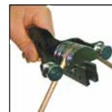
Create smooth bends in seconds for a professional look

1.800.390.3996 • phone: 330.745.3300 • fax: 330.745.3488 • www.surrauto.com