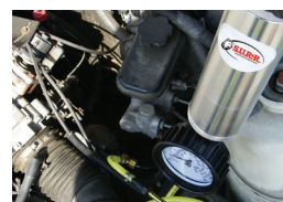
Fuel injection cleaner connected to inline Schrader valve

1.800.390.3996 • phone: 330.745.3300 • fax: 330.745.3488 • www.surrauto.com