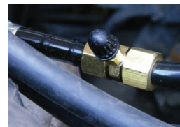
Nylon fuel line with inline Schrader valve