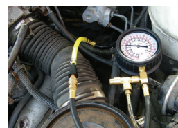
Fuel pressure tester connected to inline Schrader valve