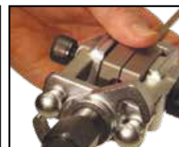
S-lock for quick assembly