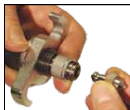
Quick chuck for fast punch changeover

All items included in kit and are available for individual order.